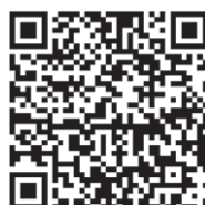
本附錄之附件A (中文)